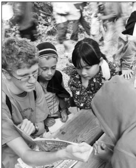
Assistant Counselor volunteers made our Nature Day Camps extra special.