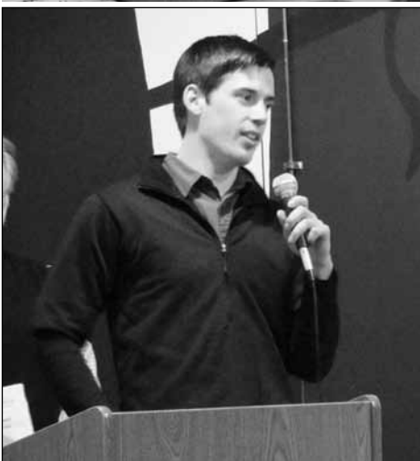
TOP: FOTC members socializing before the Annual Meeting begins.