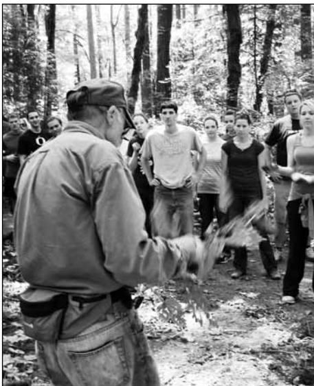
Ecotrails volunteers led the charge against invasive species.