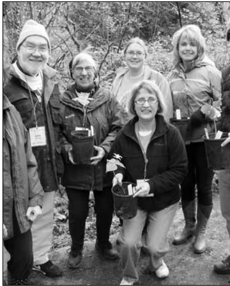
Trillium Festival volunteers sold and carried native plants for festival visitors.