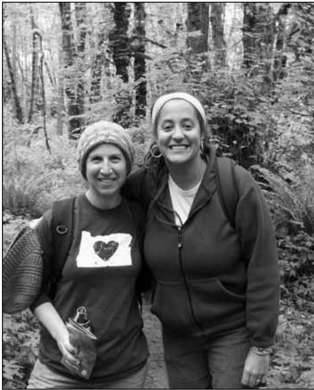
New Urban High School teachers continued to bring Youth Take Action and Environmental Science students to volunteer monitoring projects.