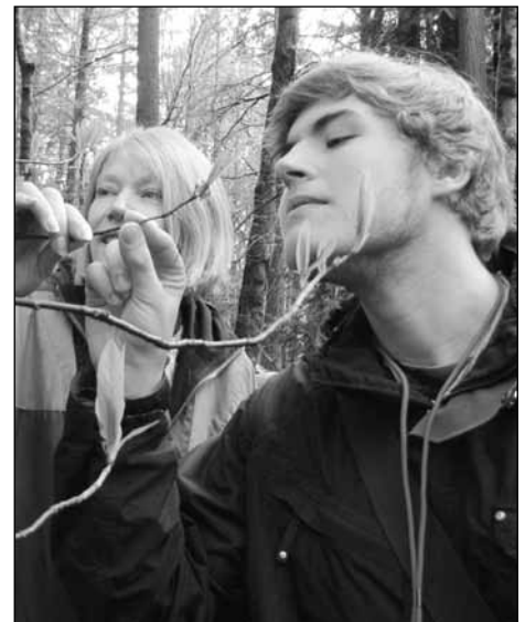
Nature Guides tested their senses and plant ID skills for school fieldtrips.