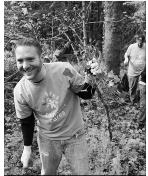
Comcast Cares Day sent volunteers to our 1 st Annual Watershed Wide Event in honor of Earth Day.