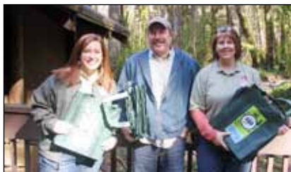
Oregon Lottery staff enjoying the 2009 Trillium Festival