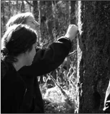
Teacher Development is an important component of the work we do here at Tryon Creek.