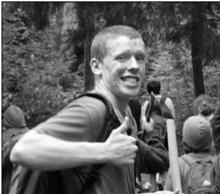
The enthusiasm of one of our Assistant Counselors

We are coming to a close with our successful Summer Day Camp