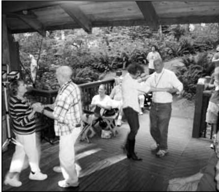
Forest Music Opening Night

They pulled Ivy for more than three hours. What an awesome example of the greater community pulling together to help protect and conserve nature.