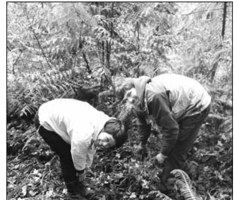
A good start to our Stream Monitoring Project

Our stream monitoring project started off with a bang with sixty volunteers from the community stepping up to