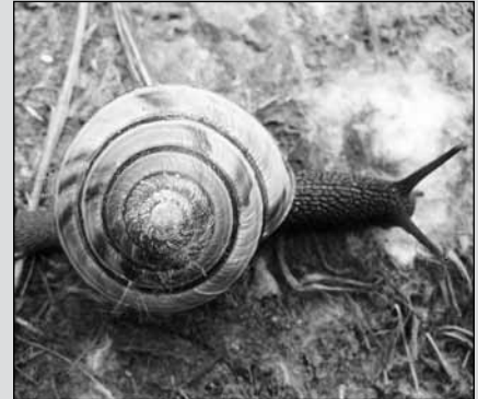
Pacific sideband snail, Monadenia fidelis

In all seriousness, I learned from someone many years ago that the brown snails are called wood snails and that was what I have called all the snails here since that day. Twice this month alone, I have had questions regarding the names of particular snails that inhabit the park. So why is it that we know the common name of the banana slug and the European black slug but have not been formally introduced to their tough-shelled counterparts?