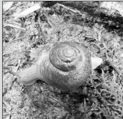
Oregon forestsnail, Allogona townsendiana

With a little help from the Electronic Atlas of the Wildlife of British Columbia and OSU, I was able to find what (I think) are the names of two native snails that you may encounter on a trail adventure at Tryon Creek. The large rosy brown snail that you see frequenting mossy mats along the ground and tree trunks has a thin black line along the bottom of the whorls for which it is named. The Pacific sideband snail, Monadenia fidelis , is the species that I see most often blending into the reddish brown shades of tree bark and duff. The flesh of the body will have a pink to burgundy brown color with a raised pebbly texture.