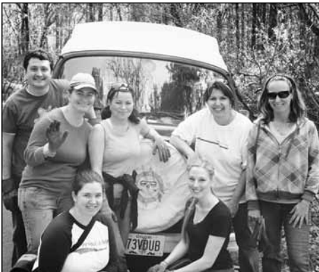
Waggener-Edstrom Worldwide celebrate Earth Day by giving back to Tryon Creek