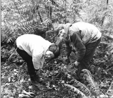
Portland Community College students and staff rolled up their sleeves and pulled together to remove invasive English ivy

A big thank you to all of the school, business, and community groups that continue to support our Stewardship programs by helping us remove invasive species such as English ivy here in the park. Below you will see a few group highlights.