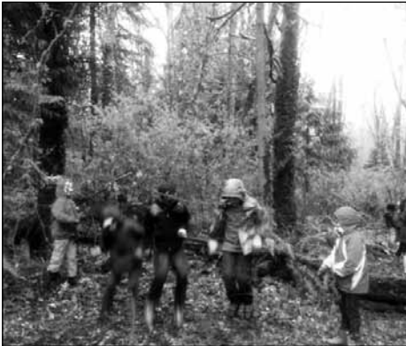
Catlin Gable students reap the rewards of their hard work by taking an ivy break to jump rope with one of their vines